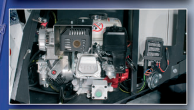
Petrol or diesel power pack as an option – power for lift also without mains.

- ensures safe access with "up and over" capability.