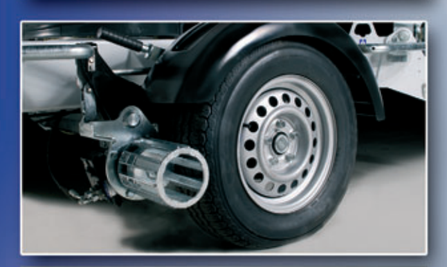
Driving system is standard – easy to move around on site.